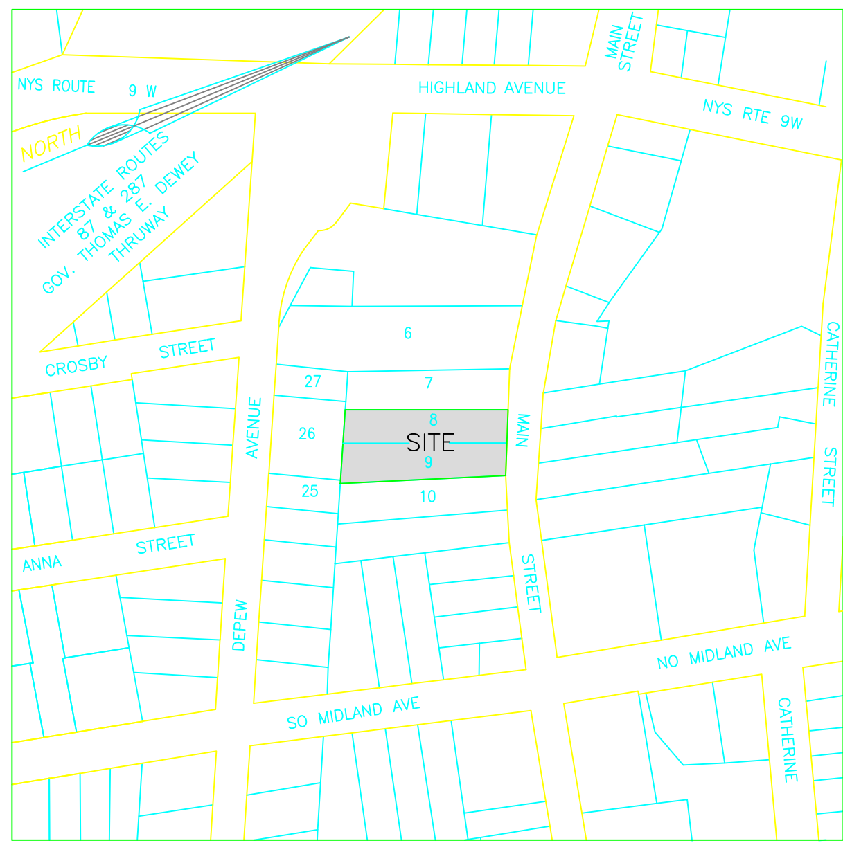
VICINITY MAP 1"=200'